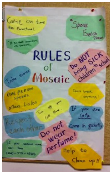
Working together at Mosaic! Student generated "rules" from Bethel 2-4