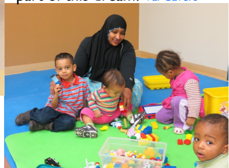
More cuteness at St Matthews!