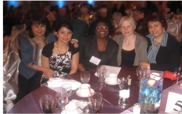
Celebrating at the Women of Distinction Awards—May 2011