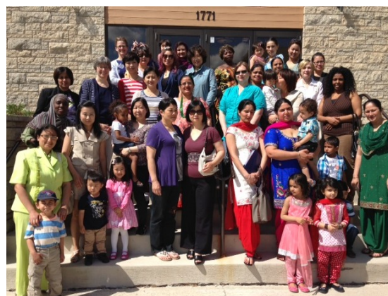
Students from Fort Garry