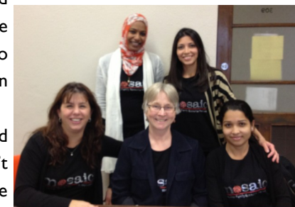
Mosaic Family Program Facilitators