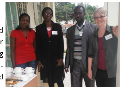
Save the Children training in Kenya

Mosaic is an organization full of passion and compassion; but the word organization doesn't fit when I talk about Mosaic. Mosaic has become a new family for all.