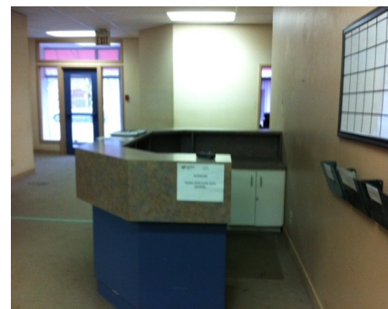
Mosaic lobby - before ...

Assiniboine Credit Union Bethel Mennonite Church Central Neighbourhood Development Corporation Citizenship and Immigration Canada Communities 4 Families FACT Coalition Forks North Portage Partnership General Authority Community Council Healthy Together Now, St James, St Vital and River Heights Jewish Foundation Literacy for Life Manitoba Community Services Council Province of Manitoba, Housing and Community Development - Neighbourhoods Alive! Province of Manitoba, Immigration and Multiculturalism - MIIP and Welcoming Communities Raise a Reader-Literacy Partners of Manitoba Scotia Bank Winnipeg Foundation Community Grants Winnipeg Regional Health Authority Youth in Philanthropy Grants - Glenlawn and Fort Richmond Collegiates