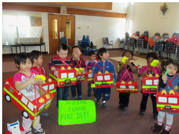
Children from Immanuel showcasing their craft projects