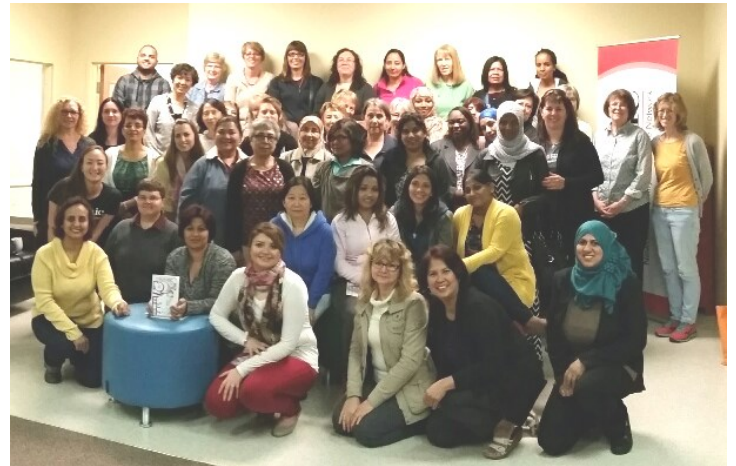
Photo taken at the Mosaic all staff meeting on September 2015.

Mosaic would like to welcome our new staff members: