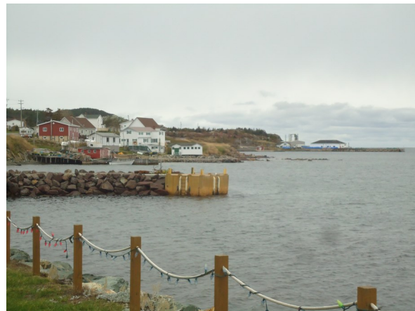
View from the coast in Newfoundland and Labrador.