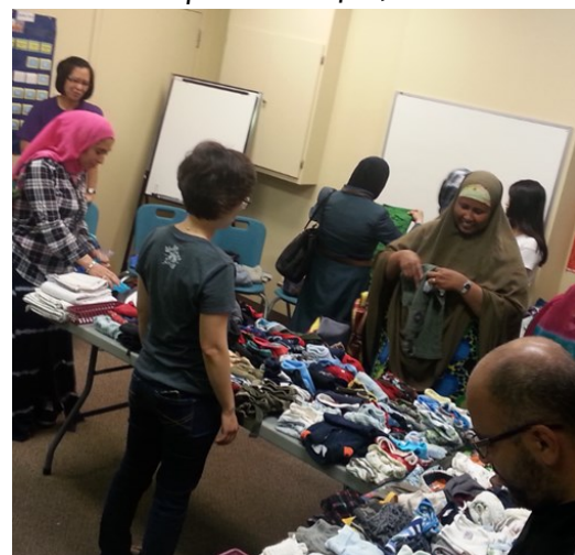
Mosaic Yard Sale!